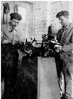
P01: 100th anniversary of the SCHNEEBERGER Group. A success story from sharpeners to linear bearings.